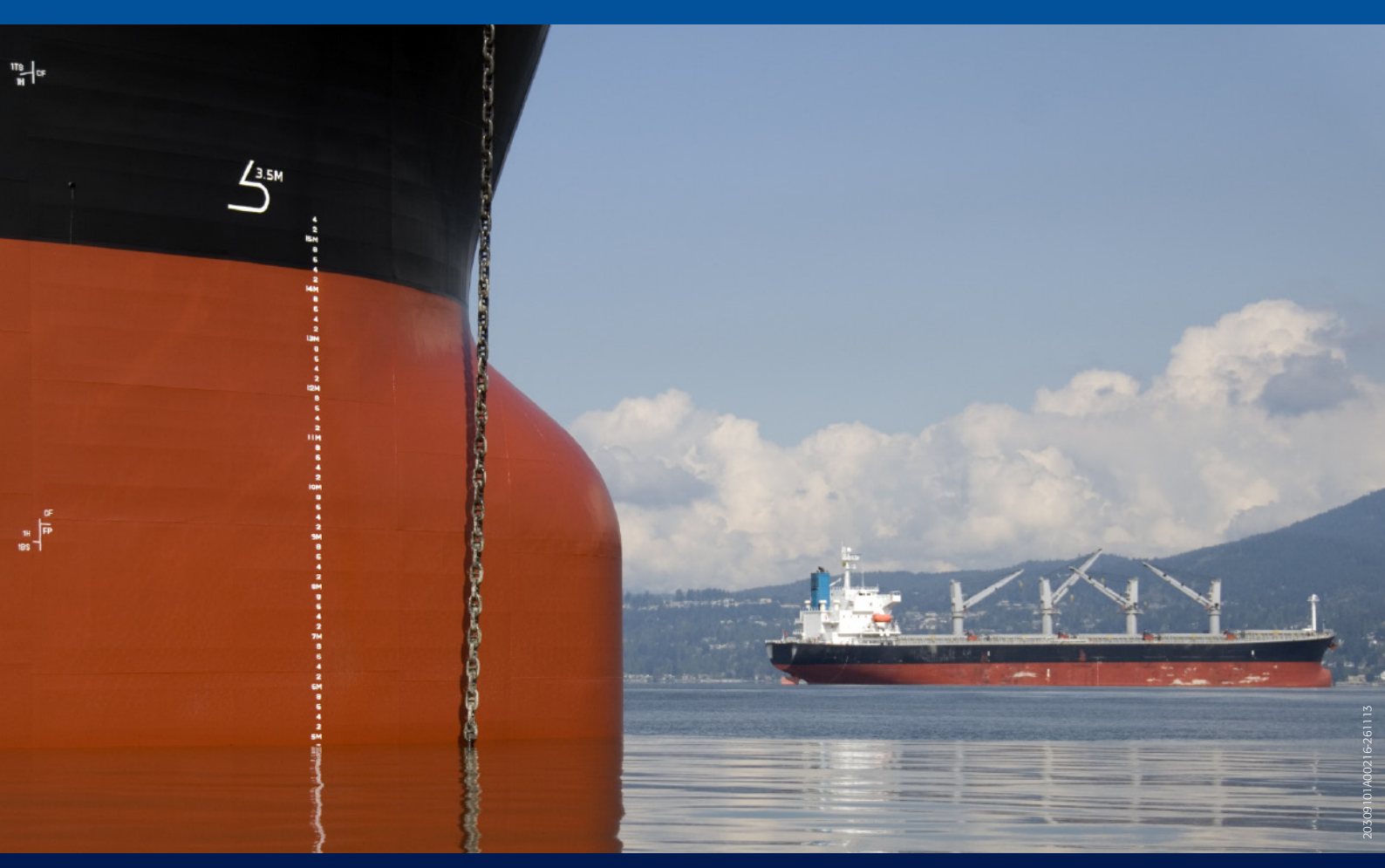
The DEIF Group: DEIF Wind Power Technology - DEIF Power & Control Technology - DEIF Marine & Offshore Technology